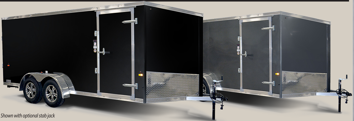
Shown with optional stab jack

SUPER LOCK.. Screwless Exterior Aluminum system is unique to AmeraLite.. No other manufacturer has it -or anything like it. SUPER LOCK.. Lasts longer, looks much better, won't rust. The inter-locking aluminum panels are glued and mechanically fastened so that it doesn't show on the outside.